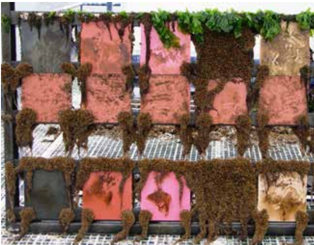
Transocean executes raft testing of antifoulings worldwide.

High pressure – and Ultra high pressure water jetting is therefore the preferred method for maintenance shipyards as it not only results in less waste but also it leaves a good clean substrate for recoating.