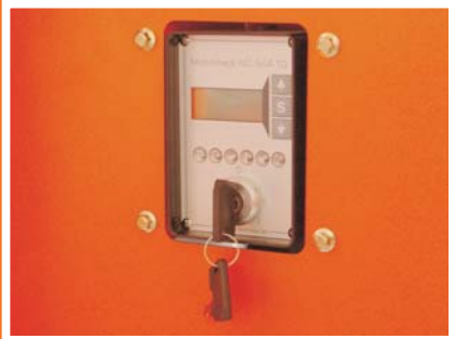
Electronic Engine Controller.