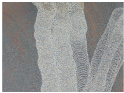
Water Blasting With Rotating Sapphire Jets.