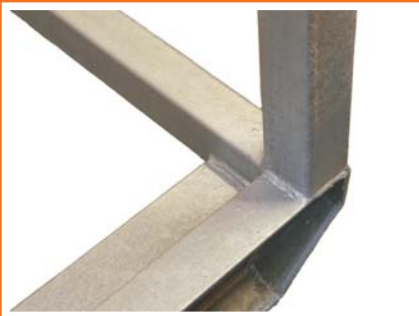
Hot Dip Galvanized Frame