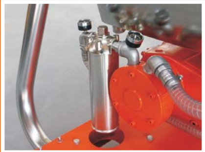
Built-on mechanical feed pump.