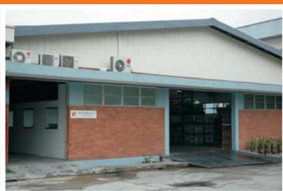
DEN-JET Factory Singapore