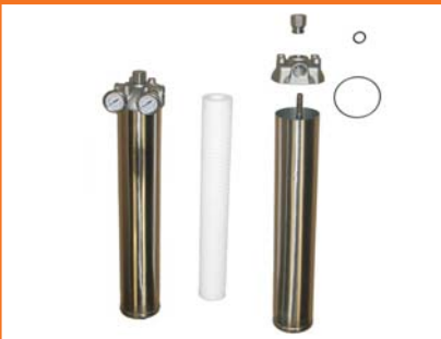
Strainers & Filtration.