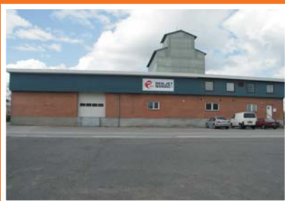
DEN-JET Factory Denmark