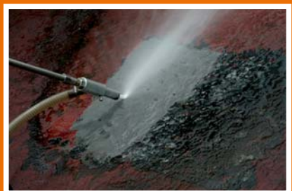
Surface - Sand blasting