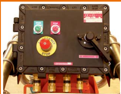
Cast electrical Eex box with main switch, star delta starter and overload relay.