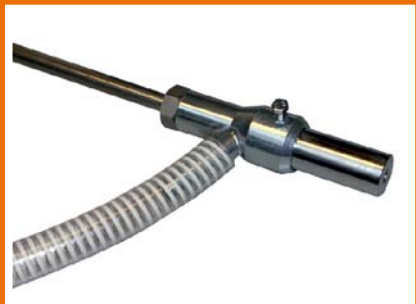
Sand Blasting Equipment