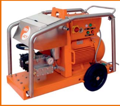
CE20-500 Super Slim