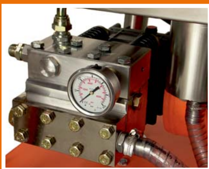
Stainless steel pump-head. Integrated unloader valve.