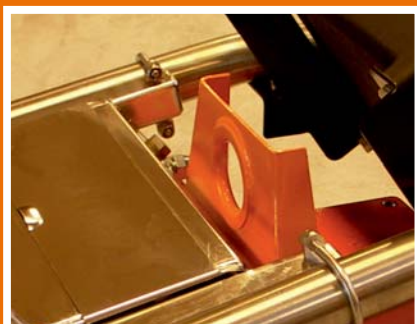
One centralized and balanced lifting eye.