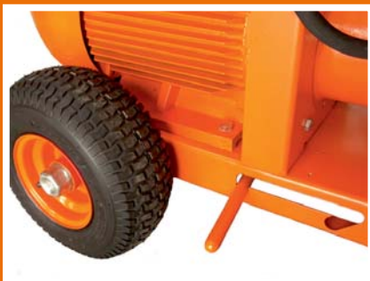
Galvanized frame with built in brake and pneumatic wheels.